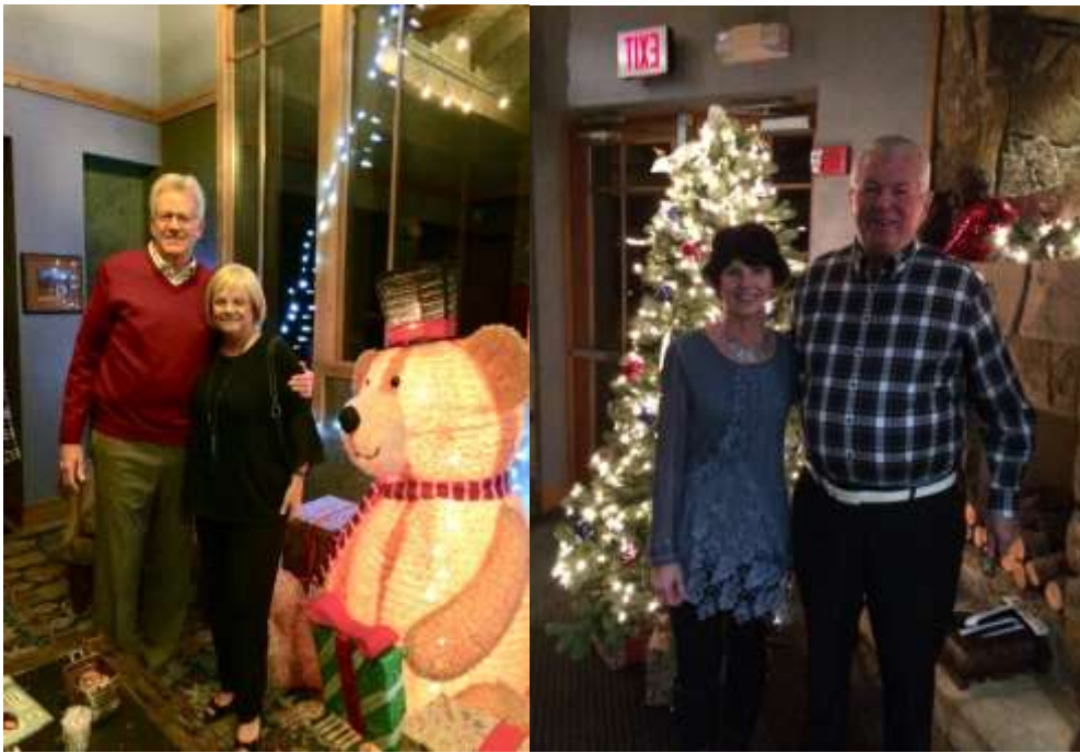
HOLIDAY PARTY BASH...DECEMBER 1 ST ...VERY FESTIVE THE BELLS AND LEFEBRE'S ENJOYING LIFE