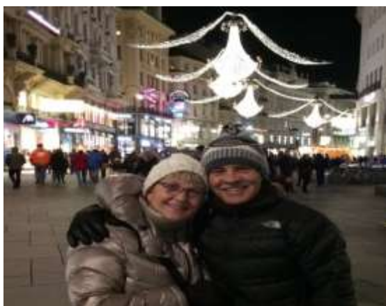
Central Vienna at Christmas!

Neighbors please share with one another news that we all would like to HEAR about in our community. It can be a "thank you", an illness, a new baby, adoption, death...anything and everything.