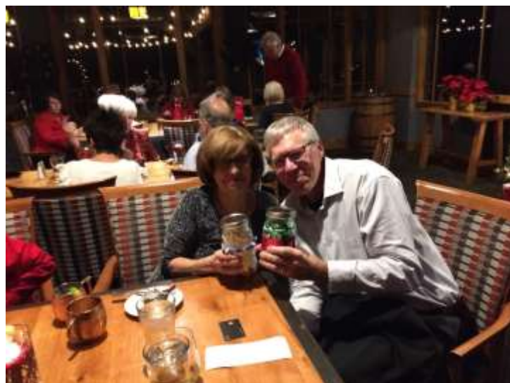
Snapshots of the Holiday Party at the