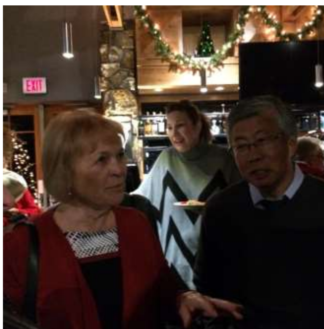
Snapshots of the Holiday Party... what fun!