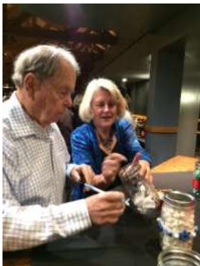
Snapshots of a festive winter party