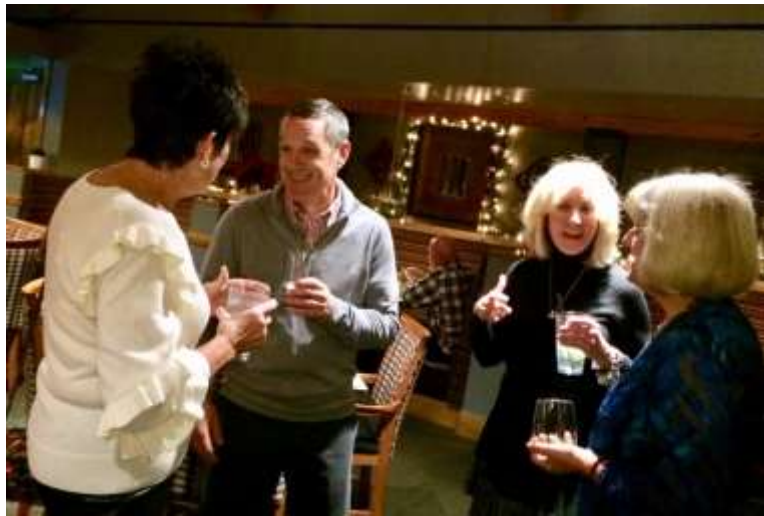
Snapshots of the Holiday ...HO HO HO